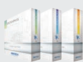
EntraPass Security Software