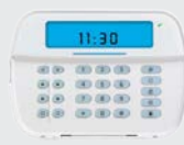
DSC Alarm Panels