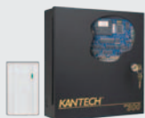
KT-100/KT-300 Door Controllers