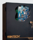
KT-400 4-Door Controller