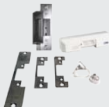
DK-1 Door Hardware Kit