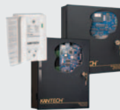
Kantech Door Controller Family