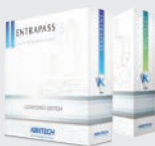
EntraPass Corporate and Global Editions