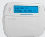
DSC PowerSeries Neo